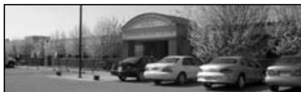
SAVANNAH-HARDIN CO. CENTER:

932 E. Church St., Lexington, TN 38351 • 731-968-5722