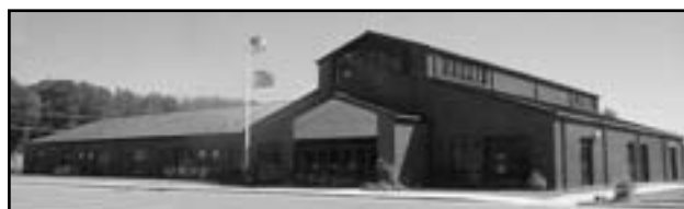
LEXINGTON-HENDERSON CO. CENTER:

1751 Main St., Humboldt, TN 38343 • 731-784-7226