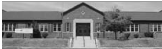
HUMBOLDT HIGHER EDUCATION CENTER:

The Humboldt, Lexington and Savannah Centers are contained in academic buildings located in their respective city-county locations. These facilities each contain computer laboratories, a science laboratory, and regular classrooms. Each has a library and learning resource area, testing facilities, faculty offices and an administrative office. Each provide admission, registration, financial aid, and counseling and advising as part of their student support resources. Each center has a schedule of courses designed to meet the needs of their respective service areas.